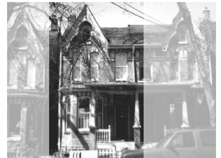
After: the restoration of 422 Sackville completes the row.