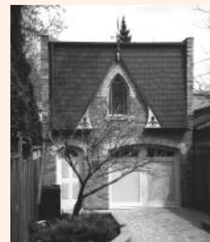
The private view facing the garden.