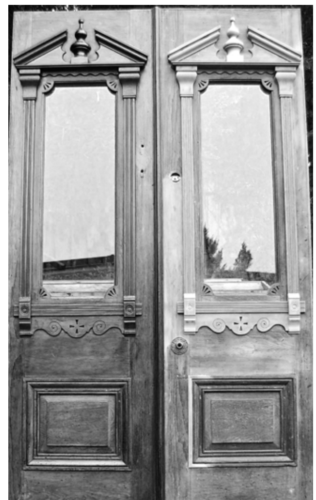
The doors restored

For more information on Heritage Mill go to: www.heritagemill.ca