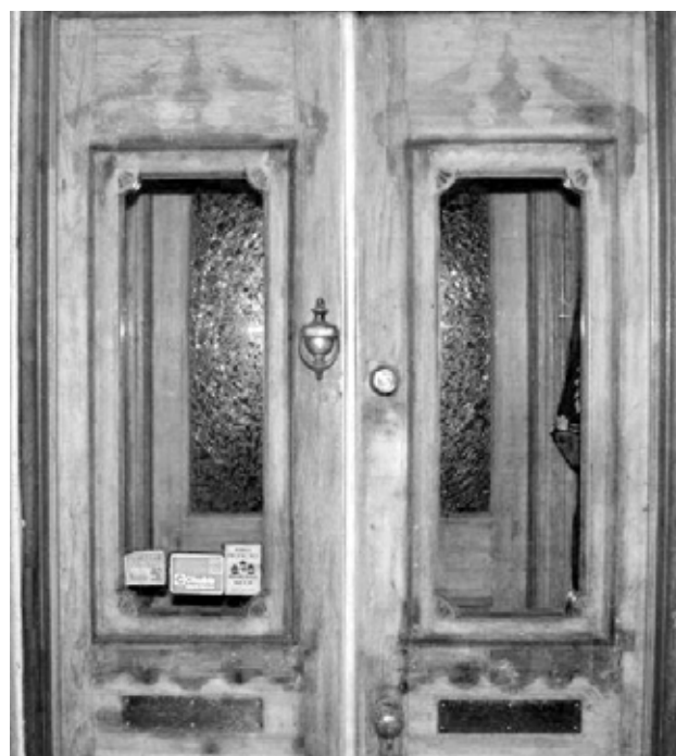
The doors as found

The double front exterior pine doors were missing the original trim moldings and decorative features. All that remained was the ghosting of what had been there. Two mail box slots had been cut into the lock rail of the doors. Research was done at both the Toronto Archives as well as the Ontario archives to try to determine what style of molding may have been on the doors. The research was inconclusive as there is no evidence that pattern books existed for this or any other buildings in the area of the time.