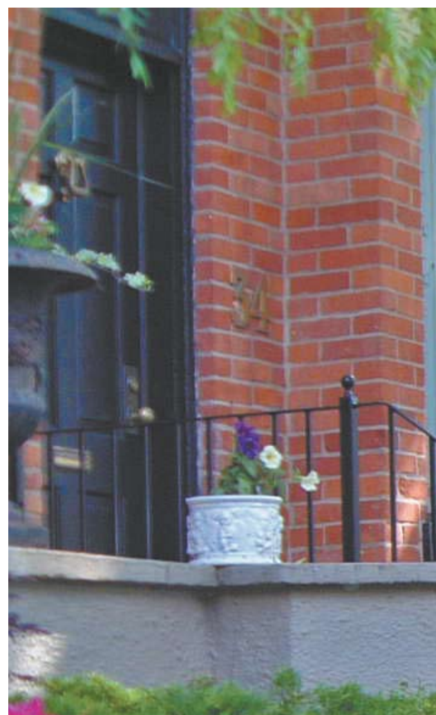
Spring 2010 volume 20 issue 1